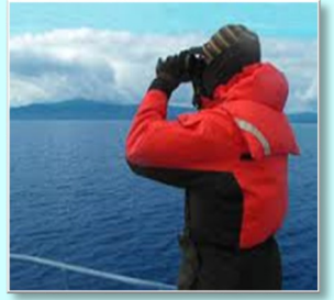
Protected Species Observer

The seismic industry employs a number of measures to ensure that marine life is protected from direct or indirect harm from its operations.