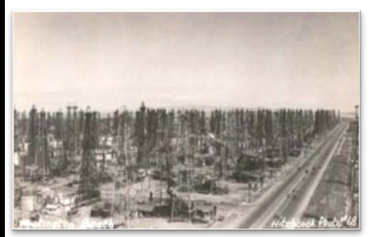
This historic postcard of Huntington Beach, California depicts numerous oil wells—an early 20th Century drilling plan. Now seismic surveys can paint a picture of the subsurface in order to better target oil and gas reserves.

Today, advancements in seismic technology have helped find, drill and produce oil and natural gas with the least risk and the least possible impact to the earth. As operators explore for oil and gas, the use of geophysical technologies helps to reduce risk in regards to cost, safety and damage to the environment. Seismic information is used to accurately plan locations for wells, reducing the probability of drilling dry wells and consequently the need further drilling, minimizing the environmental impact of the oil and gas exploration.