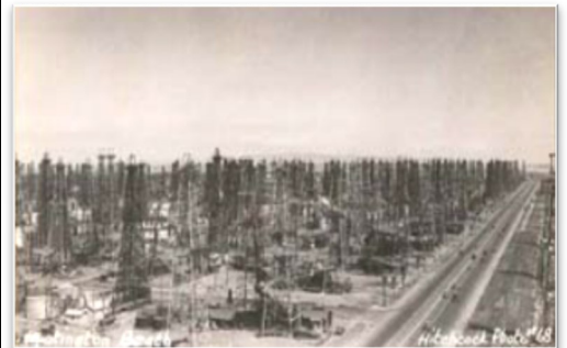
This historic postcard of Huntington Beach, California depicts numerous oil wells—an early 20th Century drilling plan. Now seismic surveys can paint a picture of the subsurface in order to better target oil and gas reserves.

Today, advancements in seismic technology have helped find, drill and produce oil and natural gas with the least risk and the least possible impact to the earth. As operators explore for oil and gas, the use of geophysical technologies helps to reduce risk in regards to cost, safety and damage to the environment. Seismic information is used to accurately plan locations for wells, reducing the probability of drilling dry wells and consequently the need for further drilling, minimizing the environmental impact of the oil and gas exploration.